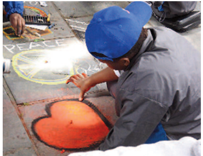
A learner takes part in the annual Chalk4Peace event outside St George's cathedral. Phoenix facilitated the participation of children with burn injuries in the event.